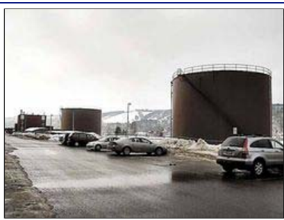
Fuel tanks are seen along Michigan Technological University's waterfront. One will likely be replaced by the three-story Great Lakes Research Center. The university's Board of Control authorized the university to proceed with the project Thursday. The board will likely approve moving forward with construction at its next meeting at May, with construction to start in the early summer.